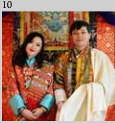
Bhutanese Costume Experience 不丹传统服装