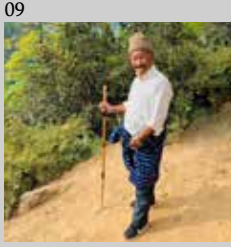
Hiking Stick at Tiger Nest 虎穴寺的登山杖