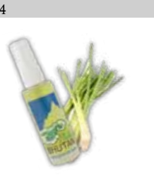
Oraganic Lemongrass Spray 天然香茅精油