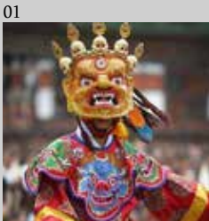
Bhutanese Cultural Dance 不丹文化舞蹈表演