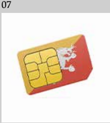
Local Data Sim Card 3GB 3GB网络电话卡