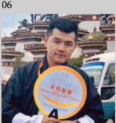
English, Chinese Speaking Guide 中英导游讲解